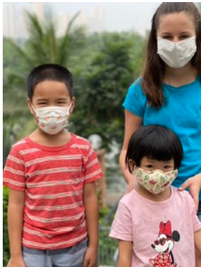
Part of our Sunday English