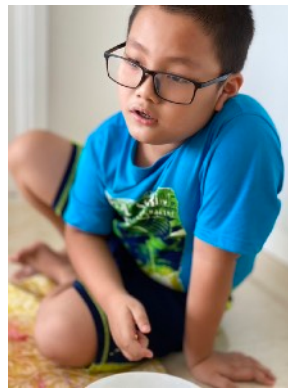
Saturday Extra Curricular